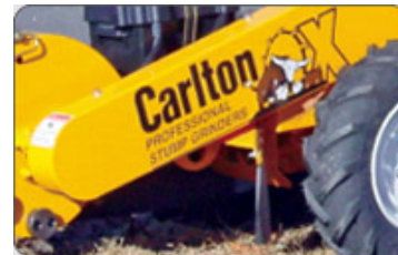
Hydrostatic Transmission allows infinitely variable ground speed control.